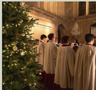
ID: NC Christmas Carol service 2024

Freshers' week is a whirlwind; leaving home, meeting new people, overwhelming. Expect highs and lows - it's normal to feel tired and uneasy. This will also be true for Oxford life in general. However, there are many people that can help regardless of your concern. The LGBTQ+ Rep, the Disabilities Rep, the Faith and Ethnic Minorities Rep, Outreach and Inreach Officers and the Peer Supporters are always willing to listen. The College also has peer supporters which are students that have undergone thorough training in order to best listen to your concerns.