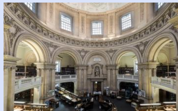
ID: Just one of the many libraries across Oxford you can work in. This is the Radcliffe Camera in the centre of town.

These are sessions run a couple of times a week with a tutor plus one or two other students on your course ('tute partners'). In these, you may either go through an essay or problem sheet you have been asked to complete before attending, or just go through concepts you struggle with/find interesting. In some subjects, you'll also attend classes, which consist of larger groups and cover general topics rather than focusing on your own work.