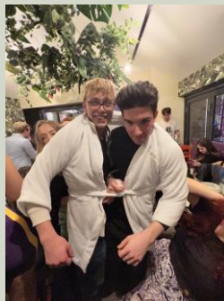
Above: Miscellaneous Crewdate antics

A shared meal between two sports teams/societies. They're typically held at curry houses like Jamal's or Angrid Thai. You pay £15 each, get an assortment of food between you and bring your own booze. Games are played and they usually turn out to be very fun evenings. They're not everyone's cup of tea, but are equally loved by many.