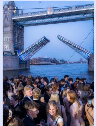
ID: New College students in black tie for the Boat Party by Tower Bridge.