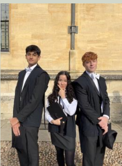
ID: Sub fusc for matriculation