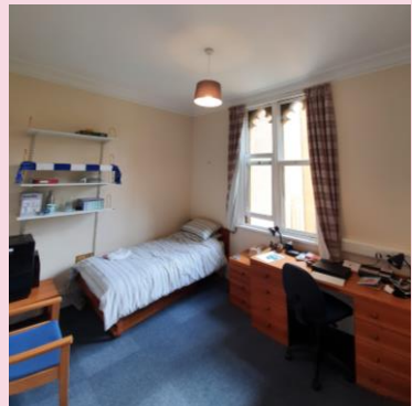
ID: Standard first-year room, showing bed, bedside table, chairs, minifridge and shelving

You'll have access to laundry facilities, meals three times a day in Hall, and IT facilities such as printing. You won't have access to a kitchen, but it's still possible to make some food in your room.