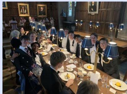
ID: NCBC members enjoying their post-Summer Eights formal