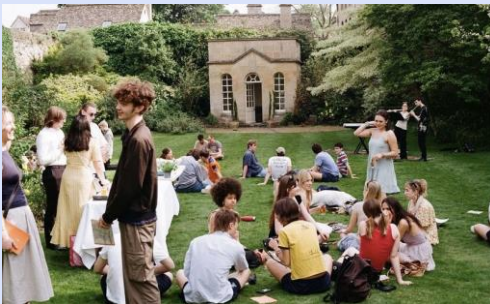
ID: The end on New College Arts Week 2024 in the Warden's gardens.

Follow the arts page on Instagram: @artsnewcollege