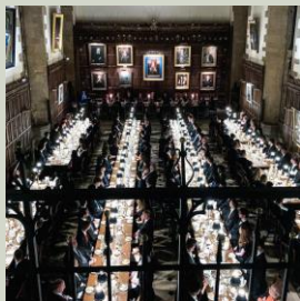
ID: New College Freshers' Formal, a great experience in Freshers' week