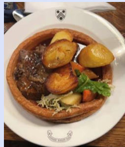
ID: An exemplary formal main course; beef roast served in a huge Yorkshire pudding!

Early hall (informal): 5:30-7:15pm every day (except formal days when it is still offered but finishes at 6:30pm)