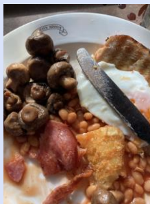
ID: A close-up of a classic New College fry-up