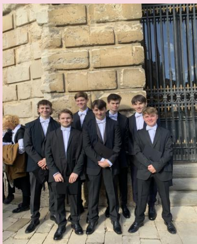
ID: Pictures of New College Freshers on Matriculation Day, wearing sub fusc