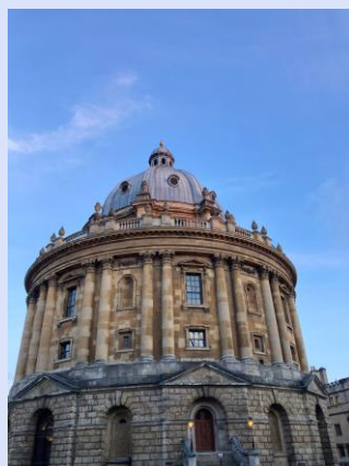
ID: The Rad Cam in all its glory against a blue sky

Oxford plays host to a myriad of libraries which you can access with just your Bod Card, ranging from old and gorgeous, to sleek and modern. Popular choices include the Radcliffe Camera (Rad Cam) and the Vere Harmsworth. You will also have a subject-affiliated library, such as the Social Science Library or Law Library.