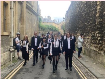
ID: NC Fresher historians on their way to their exams