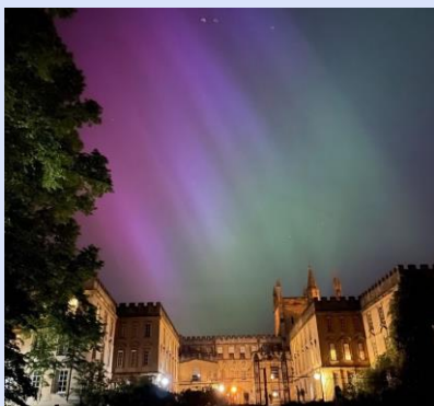
New College's natural environment is second to none! Left, Garden Quad featuring the Northern Lights. Right, Cloisters

The environment is the greatest challenge of our times and there are various ways students at New College can get involved. First and foremost, being connected with nature is the best way to make one want to protect nature. Groups from New College frequently go wild swimming at Hinksey Lake and Port Meadow, which are both around a 25 min walk from college. We will visit these spaces with a litter picker and bin bag to ensure that we leave these spaces cleaner than we found them. New College is lucky to have a large amount of green space on site, and the E&E Officer, Freya Mills , is always looking into new ways to utilise this space and get students more involved in our greenspaces. On a uni-wide level, Oxford Climate Society host interesting talks every week with engaging speakers. Freya will also run Eco Drinks at New College, as a space where students can voice their ideas and concerns about the environment at any scale from global to collegiate. In Freshers' Week, there will be a short sustainability talk where students will learn the simple steps that they can take to reduce their environmental impact at New College. Every student will have a recycling info sheet in their room which they can consult throughout the year.