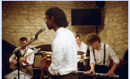
ID: Students performing during New College Arts Week.