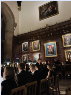
ID: New College '22 Freshers' Formal

n.b. Guest night is booked through the same system as formal hall.