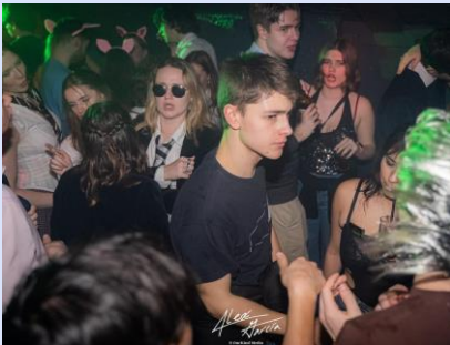
ID: NC students enjoying a BOP in Plush, this theme was British icons, see if you can guess who people dressed as.