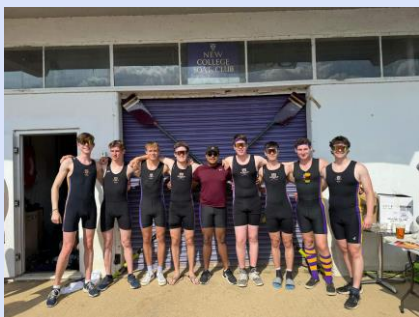
ID: NC M2 after their summer eights campaign

Another perk provided by College is free access to the Iffley Gym, which is about a 20-minute walk from College.