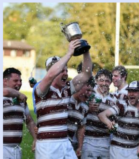
ID: New College RFC celebrating after winning cuppers in 2024