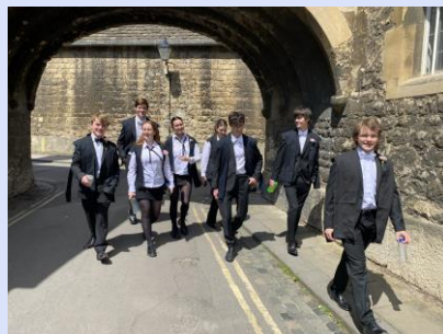
ID: New College students, in sub fusc, on their way to their exams

Prelims and Mods are the first public examinations, held at the end of Trinity (Summer) term for most subjects and at the end of Hilary (Easter) term for Lawyers. Classicists will have Mods in Hilary of their 2 nd year. These exams don't count towards your final degree grade but you do need to pass! Aim to do the best you personally can — exams are your chance to show off all you have learnt through the year.