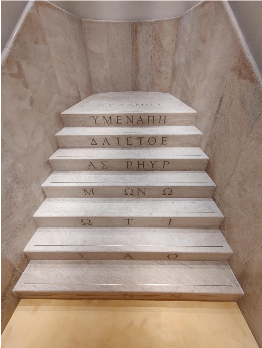
Full Staircase, Gradel Quadrangles, New College, Oxford

I didn't have to wait long for the proof that my brain-teaser was a success. At the grand opening ceremony on 13 April 2024, I stood incognito by the staircase, listening to the reactions of those who tried to make sense of it. It wasn't long before I heard two pretty venerable looking gentlemen, completely baffled, wonder whether 'the chap who wrote this really knows any Greek at all'!