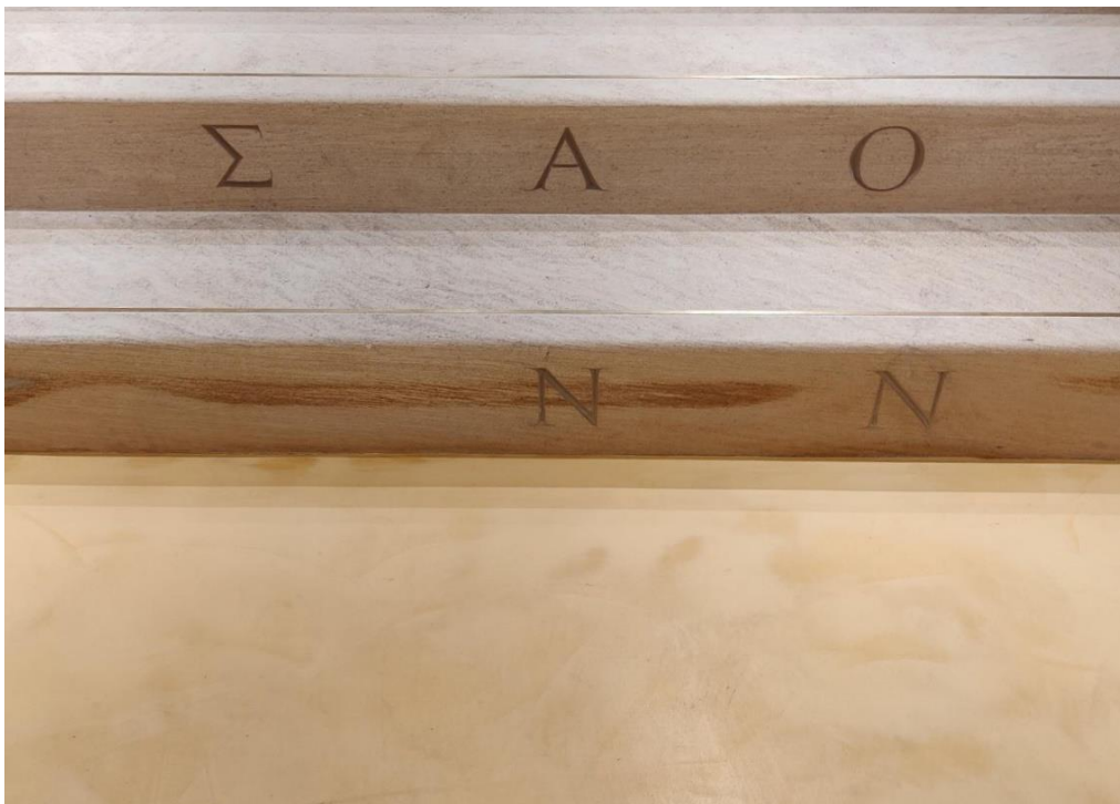
Staircase (bottom), Gradel Quadrangles, New College, Oxford

In short, the horizontal word at the top names the space, and the vertical words (ΟΥΔΑΜΩΣ ΥΜΑΣ ΔΕΙ ΑΝΕΡΩΤΑΝ ΜΑΤΗΝ ΟΠΟΥ ΥΠΕΡΩΙΟΝ) offer timely advice about a question which shouldn't be asked; and, if anyone does, the answer is the word at the top!