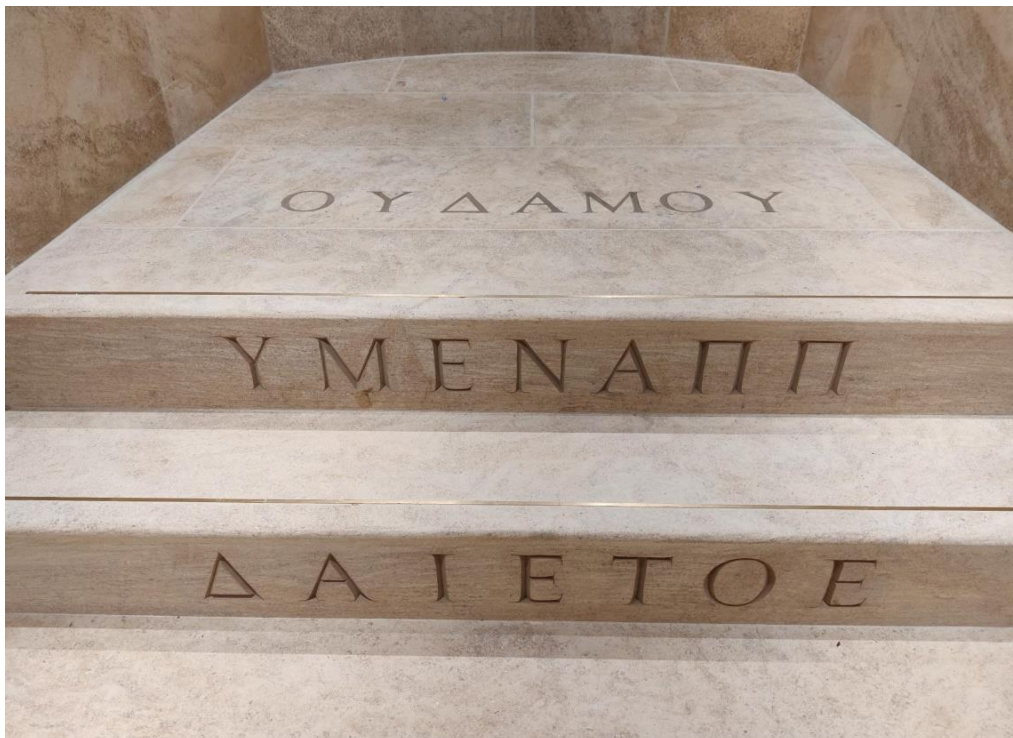
Staircase (top), Gradel Quadrangles, New College, Oxford This and following images © Courtesy of the Warden and Scholars of New College, Oxford

Ο Υ Δ Α Μ Ο Υ Υ Μ Ε Ν Α Π Π Δ Α Ι Ε Τ Ο Ε Α Σ Ρ Η Υ Ρ Μ Ω Ν Ω Ω Τ Ι Σ Α Ο Ν Ν